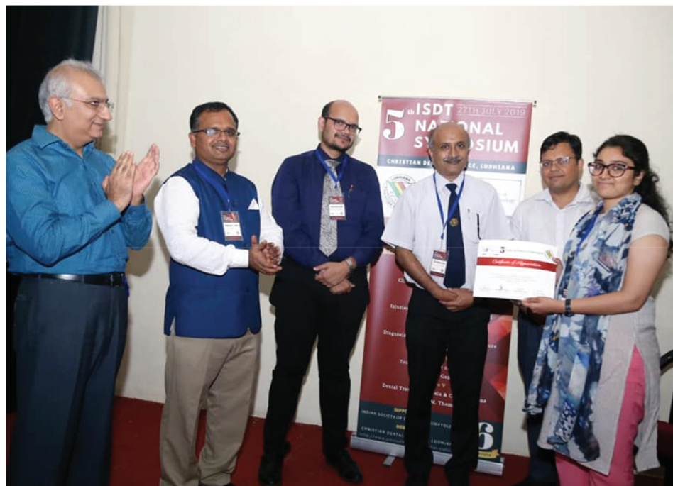
The 5th National Symposium of ISDT was held in the historical Wellington hall of Christian Dental College, Ludhiana, Punjab on 27th July 2019. It had a participation of over 400 delegates from 14 dental colleges and many private clinics.